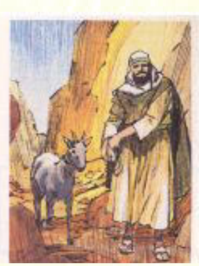
The Azazel Goat-It was on the head of this goat, representing Satan, that the sins of Israel were placed. Azazel was then led into the wilderness, symbolically carrying their sins with him.

Let's notice a modern Jewish commentary that makes it clear that the azazel goat represented _ Satan the devil: "Azazel...was probably a demonic